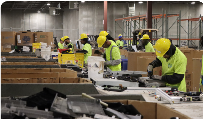
RecycleForce's 11-week workforce development program is designed specifically for formerly incarcerated individuals.

Their 11-week workforce development program is designed specifically for formerly incarcerated individuals and provides jobs in their recycling facility as De-Manufacturing Specialists, breaking down electronic items into pieces that require different recycling processes. Successful participants can be promoted to serve as team leads and peer mentors on the warehouse floor, where more than 120 people work.