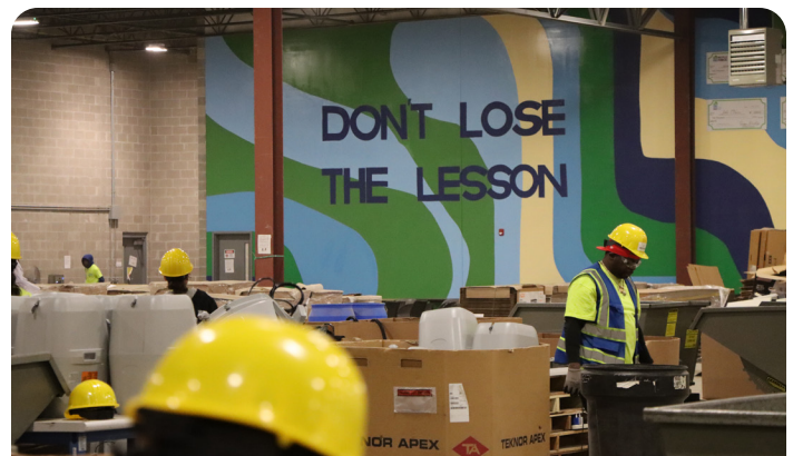
Since December 2023, Second Helpings has provided more than 3,800 pounds of non-perishable food for RecycleForce.

Since February 2024, RecycleForce has also helped us expand our own recycling program. Twice a week, RecycleForce picks up pallets of plastic and metal from Second Helpings to recycle. In that time, we have recycled nearly 12,000 pounds with RecycleForce.